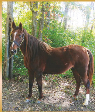
Callaway's Summer Rain (BHF) Callaway's Blue Norther X Magical Fascination