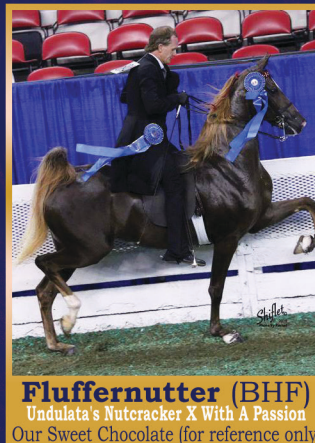
Fluffernutter (BHF) Undulata's Nutcracker X With A Passion Our Sweet Chocolate (for reference only)