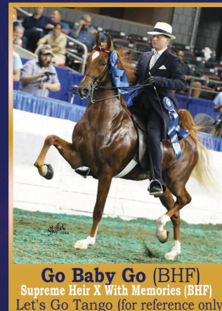
Go Baby Go (BHF) Supreme Heir X With Memories (BHF) Let's Go Tango (for reference only)

The Broodmare Hall of Fame (BHF) was established in 1972 as a project of the Southeastern Futurity to honor special mares that greatly contributed to the breed. ASHA accepted responsibility for the BHF in 1981. Criteria for inclusion is now based on computer-generated data through the American Saddlebred Registry, not subjective selection. A mare must have produced a minimum of three offspring that earned a combination of the following titles at the Kentucky State Fair World's Championship Horse Show: three world's champions; or two world's champions and one reserve world's champion; or one world's champion and two reserve world's champions. In any combination, the mare must have produced three different offspring, each of which must have won one of these titles in any division at the KSF WCHS except in hand, equitation or Kentucky County Fair classes. At least six horses must have shown in the qualifying class and four horses in the championship class. One of the following can replace one world's champion or one reserve world's champion requirement: the mare produced one sire of five world's champions, or the mare produced one producer (dam)