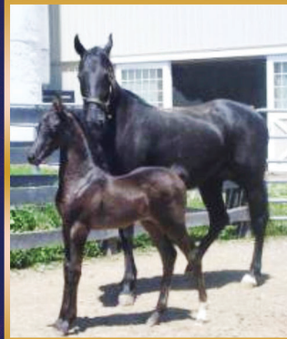
My Prom Night (BHF) Periaptor X All Roses (BHF)