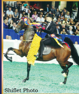
Shiflet Photo CHOur Charming Lady (BHF) Santana's Charm X My Bugatti Royale (BHF)