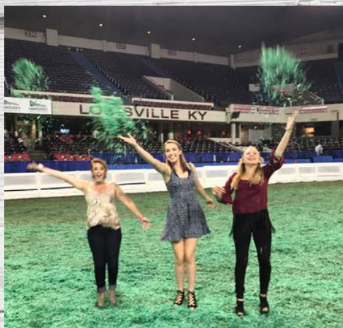
Some happy first timers at Louisville