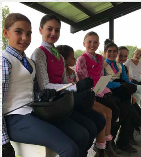
Students from Avalon at West Coast Morgans. Academy show enjoying the day