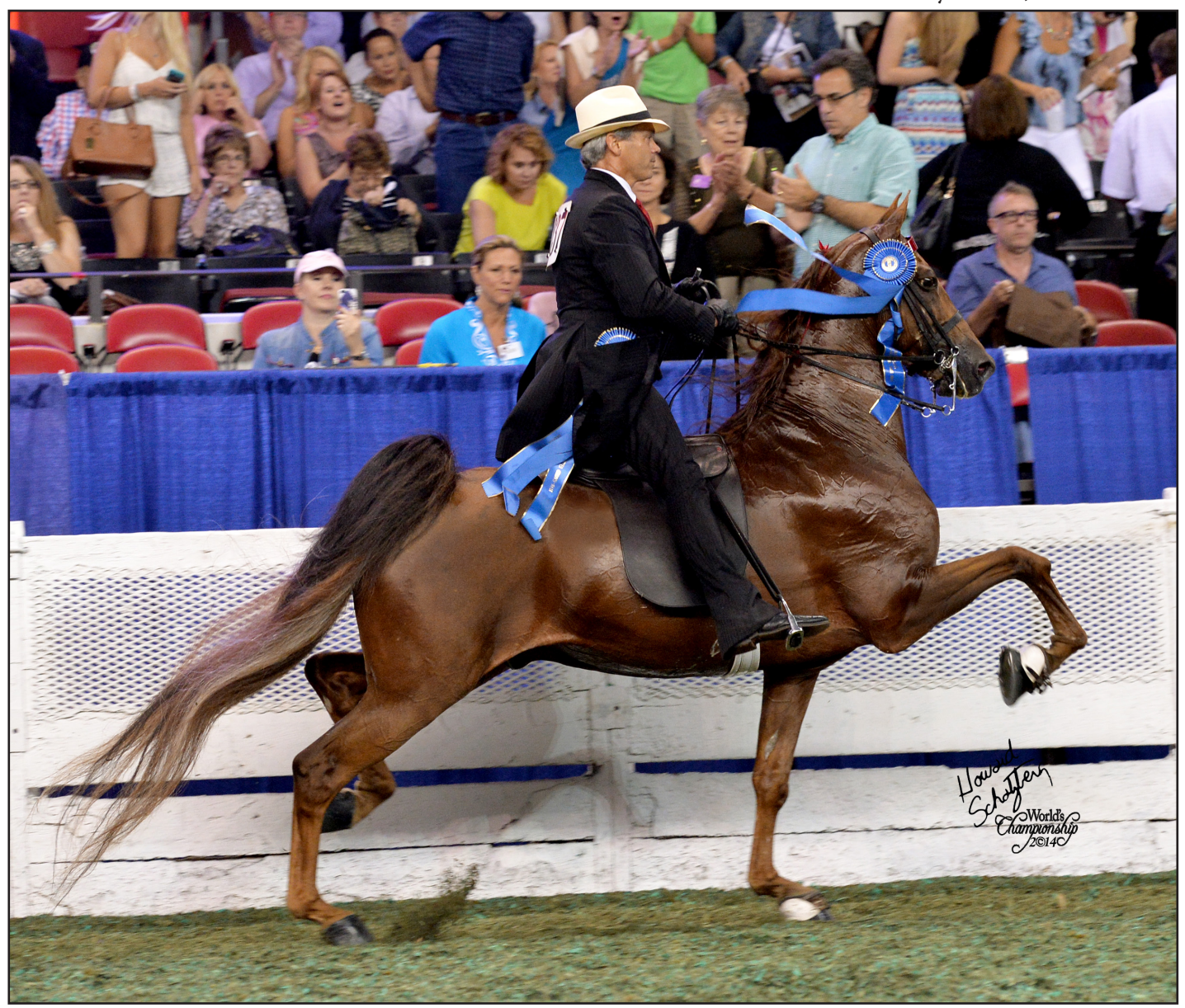
<sup>CH</sup>The Daily Lottery winning the 2014 Five-Gaited World's Grand Championship