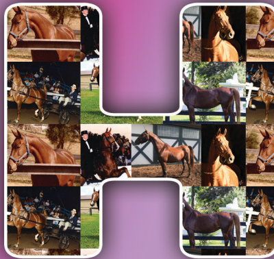
THE KENTUCKY KITTY