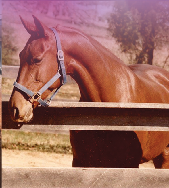
COMMANDER'S DIAMOND DOLL