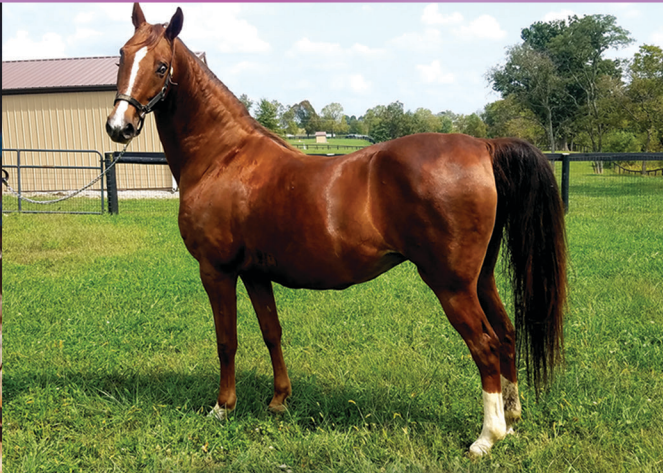
MAN WHAT A DREAM