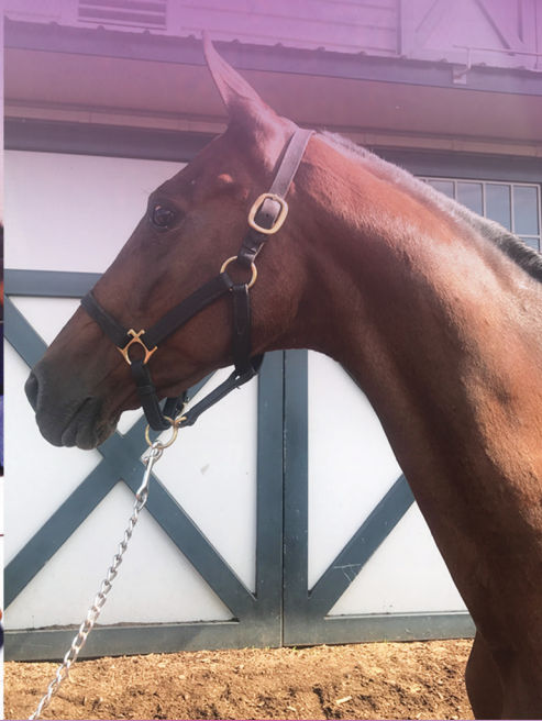
HARLEM'S SO RARE