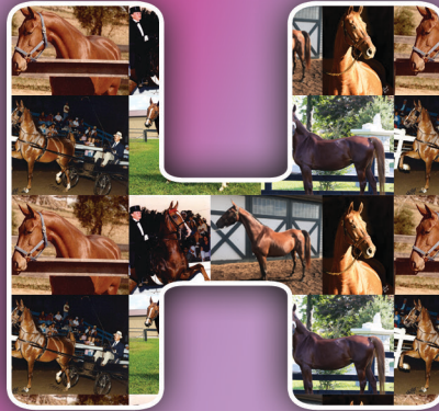
THE KENTUCKY KITTY