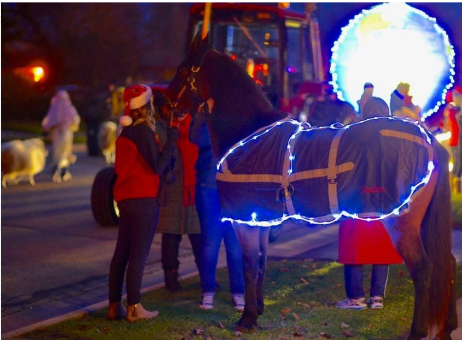
2016 OCONOMOWOC CHRISTMAS PARADE

The officers, members, and families of the Equitate Equestrians Youth Club of Equitate, LLC in Ixonía, Wisconsin have had an awesome winter and start of spring!