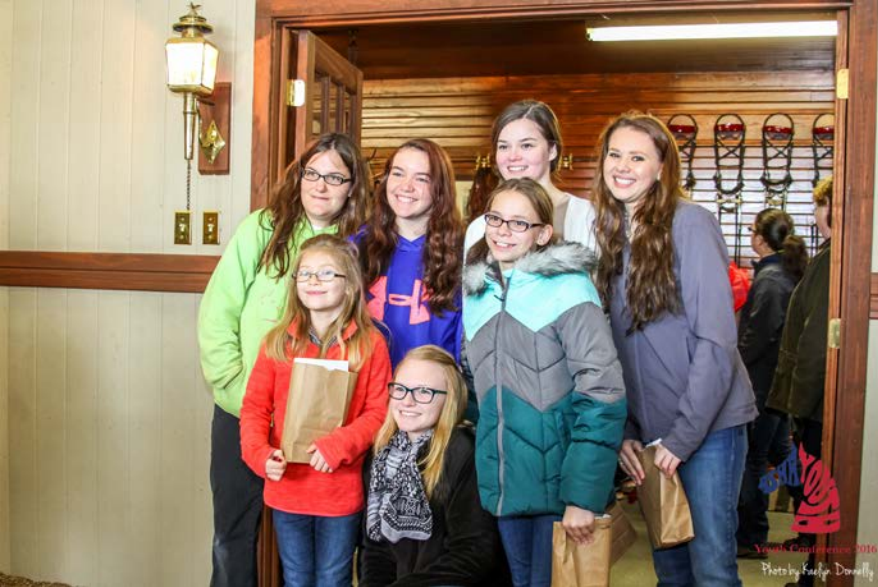
Youth Conference 2016