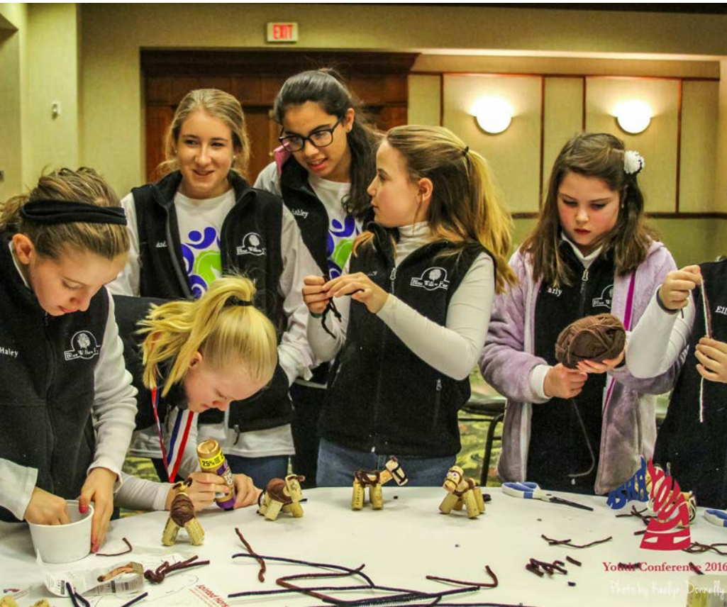
Youth Conference 2016