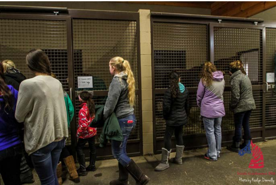
Youth Conference 2016