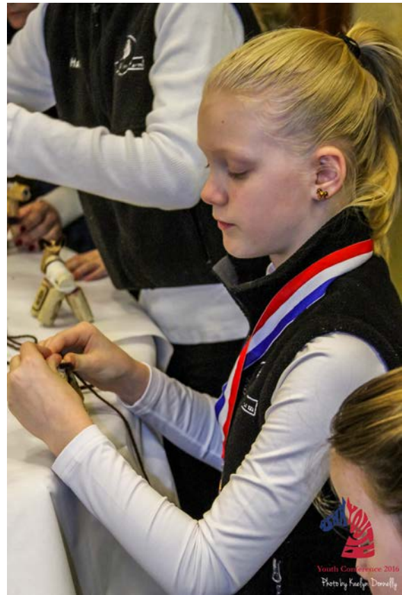
Youth Conference 2016