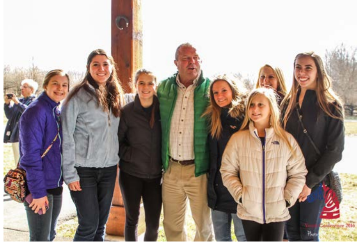
Youth Conference 2016