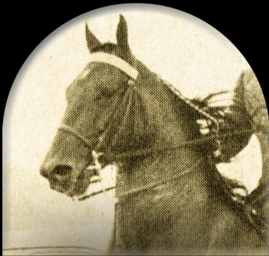
WC SOLID MAHOGANY foal of DEPUTY LADY (BHF)