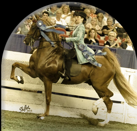
WCC HE'S IN STYLE foal of SHE'S IN STYLE (BHF, RWC)