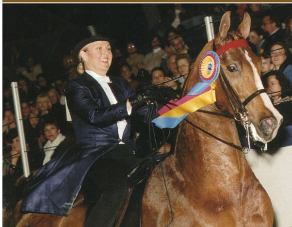
For reference only, WC Strapless, dam is She's Superb (BHF)