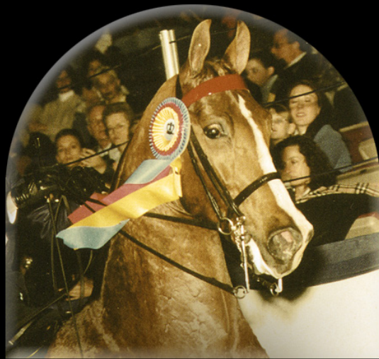
WC STRAPLESS foal of SHE'S SUPERB (BHF)