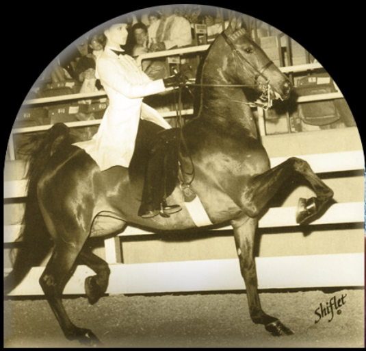
WC HARLEM'S GEM foal of JEWEL'S SYMBOL (BHF)