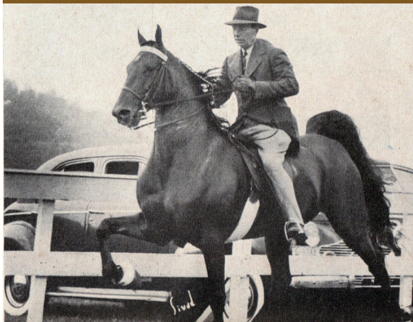
For reference only, WC Solid Mahogany, dam is Deputy Lady (BHF)