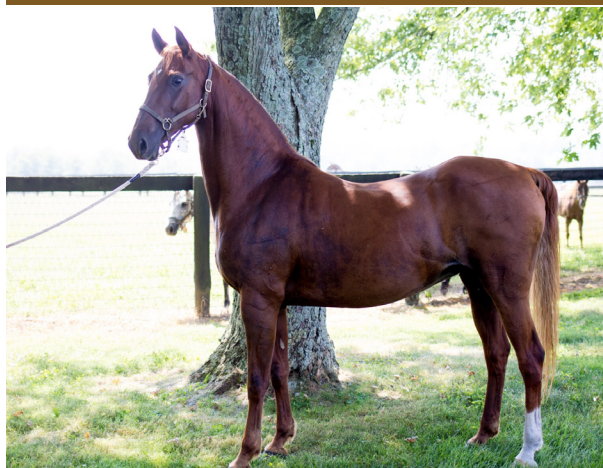
RWC She's In Style (BHF)