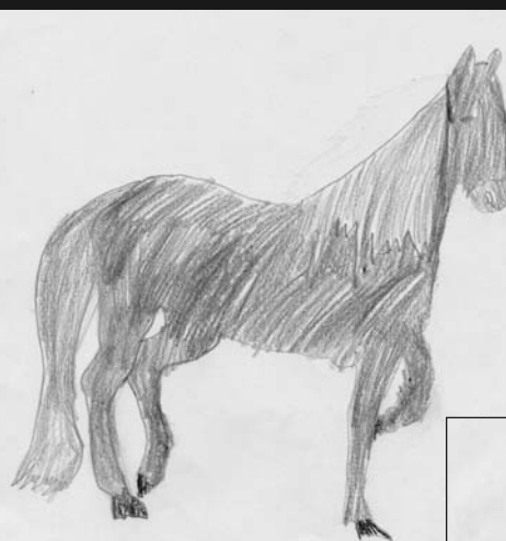
◀◀◀ Camryn Mallery, Grand Blanc, MI, age 8