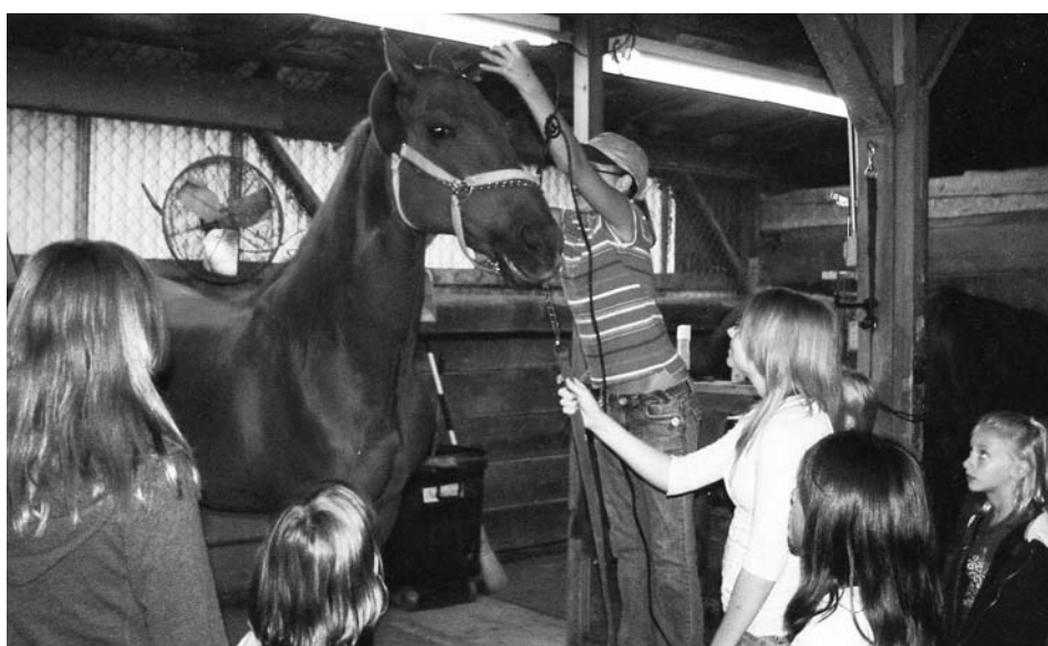
Top: Tall Tails members at their fund raising booth at the “Good Times in Goodrich” 2009 Festival. Above: Horse clipping demonstration at the Tall Tails’ Executive Farm Summer Camp.

Equine Field Day in June, the “Hats Off to the Horse Industry Day” at the Kentucky Horse Park in August, and the “Experience the Horse” activities during the Festival of the Horse in Georgetown, Kentucky in October. Club members had a float in the Festival of the Horse, Colt and Filly Review Parade which ended up winning 2 nd Place in the Best Float category. During the parade, members passed out brochures about the American Saddlebred, Junior Junction magazines, and flyers on the benefits of learning to ride. They also had a “Pumpkins for Puppies” booth during the Experience the Horse activities at the local park. The pumpkin painting raised over $200 for the Scott County Animal Shelter. The Mustangs also donated jars of Saddlebred Salsa for the gift bags for the Media Day event at the Kentucky Horse Park in July. Several reporters from a wide variety of publications attended including representatives from Southern Living magazine and many horse publications from across the country. They also were invited by the Kentucky Horse Council to set up a table to sell Saddlebred Salsa during a program they are sponsoring in November called “Your Future with Horses.”