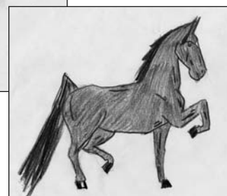
Michaela Kratofil Grand Blanc, MI, age 12