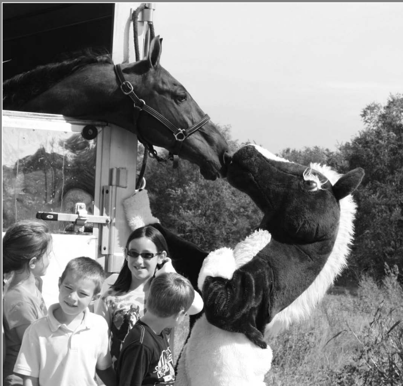
ASHA youth mascot Maxine finds true love while on a trip with the Timbermist Cutback Kids.

Junior Junction is published by the American Saddlebred Horse Association, Inc. 4083 Iron Works Parkway, Lexington, KY 40511. Telephone 859/259-2742. Fax 859/259-1628. E-mail: saddlebred@asha.net . Website: www.saddlebred.com .