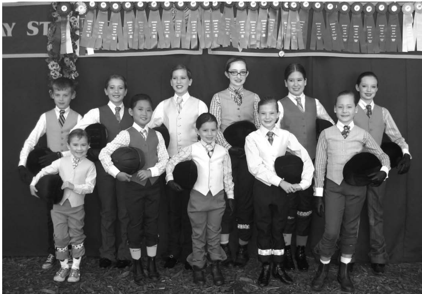
Above: The Bridleway Barn Stormers at the Pine Cone Classic Horse Show in Flagstaff, Arizona. Below: The Barn Stormers collected more than 100 pounds of food for the Foothills Food Bank.