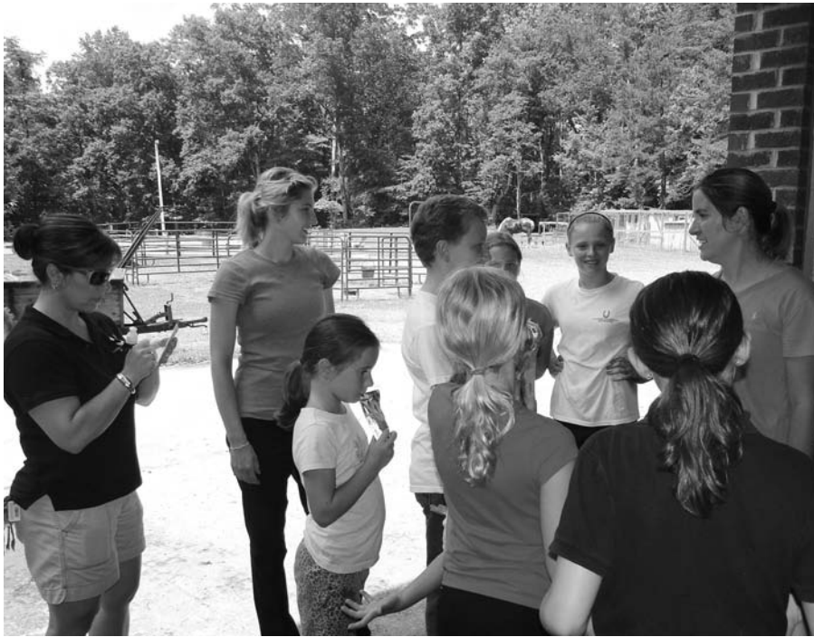
The High Caliber Hot Shots visit Riverwood Therapeutic Riding Center.