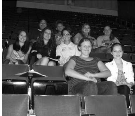
Youth enjoyed a Junior Judging contest at the World's Championship Horse Show at the Kentucky State Fair. Turn to page 4 to see how they placed.