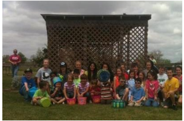
VPF Stirrup Squad Annual Crawfish Boil and Easter Egg Hunt

at both and donate ALL sales to Saddlebred Rescue! We will kick off our 2013 show season on April 19-20 at the ETSA Spring Classic in Cleveland, Tennessee. May 18th is going to be a BIG day for all the Rock Stars! We are having our first annual Open House. We will have pony rides, concessions, and student demonstrations throughout the day. We will be having two work days prior to the 18th to paint the barn and do some other projects around the farm.