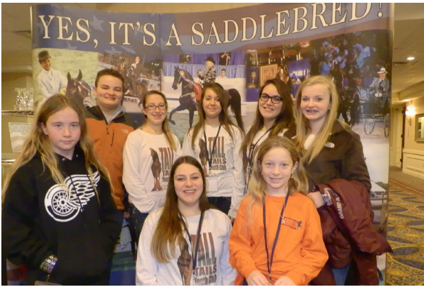
Tall Tails at ASHA Youth Conference