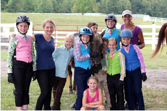
Landon Farm Youth Club

The Landon Farm Youth Club has just completed our first full quarter since being established late in 2012 and we have really hit the ground running! We had a number of great events that we have attended and been able to support, plus a very healthy line-up of fun events for the coming months.