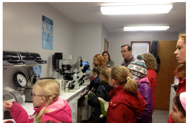
Lion Heart at veterinary clinic