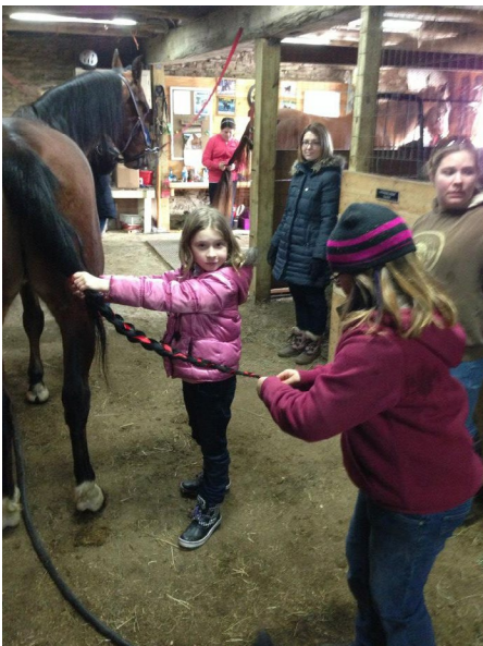
Sugar Valley Farm braiding Tails

braiding Saddlebred tails. On February 23rd, our members also spent time volunteering at the Pennsylvania Saddlebred Horse Association booth that was set up in the Horse World Expo in Harrisburg, PA. Our youth did a great job educating the public about our extremely intelligent and beautiful breed. They also had a fun time watching the various horsemanship clinics and demonstrations that were presented at the Expo.