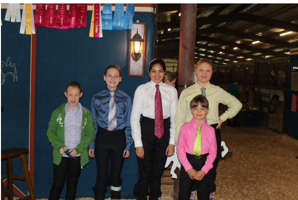
VPF Stirrup Squad Members