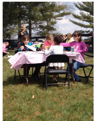
Three legged races during the Easter festivities at Diamond View Farm

More fun activities to follow this summer!