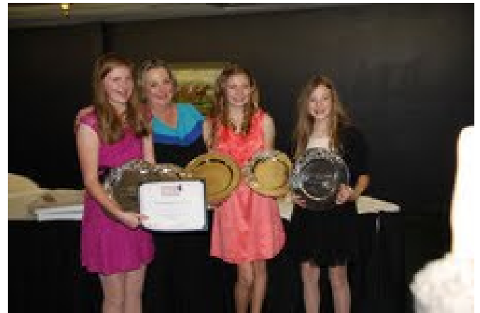
Barn Stormers at the ASA of Arizona Banquet