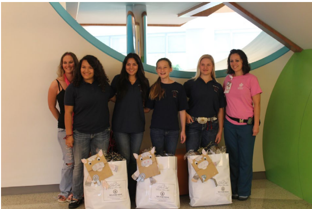
VPF Stirrup Squad Officers

The Vantage Point Stirrup Squad has started off 2013 with a canter! We had our first meeting in January where a year