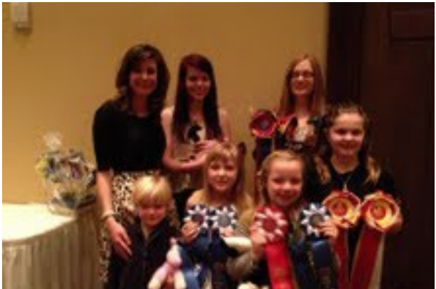
Rocking S takes home awards from the ASA of Alabama Awards Banquet

March ended with Spring Break Camp! Our camp was structured as individual days, each with a different focus, so that riders could do the whole week, or pick and choose days. Day 1 was Barn Management Day, in which the kids got to come to the barn early and do all the morning chores, including feeding, stall cleaning, and turnout. Once the chores were done,