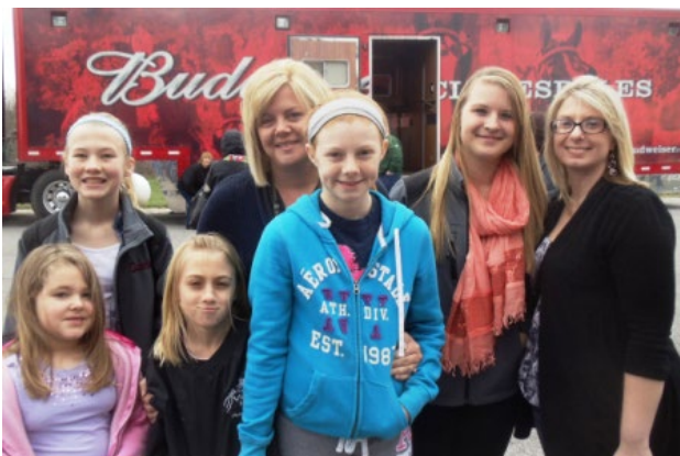
Abby Road Riders visit to see Budweiser Clydesdales

The Abby Road Riders located in Peculiar, Missouri just outside of Kansas City, took a field trip this past Saturday. We went to Warm Springs Ranch, located in Booneville, Missouri and home to the world renowned Budweiser Clydesdales. After our tour at the ranch, we proceeded