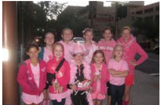
Barn Stormers walk for the cure