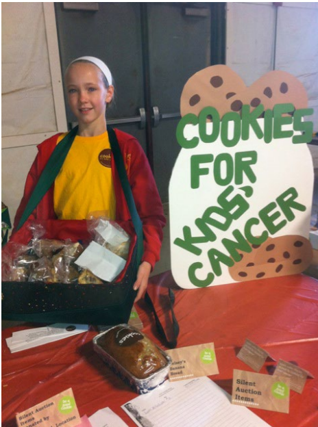
Lion Heart-Cookies for Kids Cancer Bake Sale

We started March with our first horse show of the season, with three riders showing at William Woods University Winter Fun Show. Our riders all moved into new divisions or onto new horses, so it was a learning experience for everyone. It was also a learning experience for the participants in our Junior Grooms program. Junior Grooms are young riders who have proven an ability to focus and willingness to work hard. They then get to come to the barn and stay all day on Saturdays and travel with