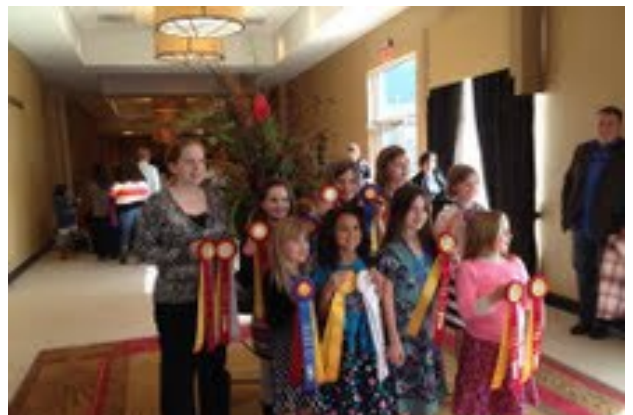
Rocking S wins awards at the Alabama Winter Tournament Association Banquet

We had a great 2012 show season! Several Rocking S Farm Rock Stars came home from the ASA of Alabama banquet as High Point Champions or Reserve Champions. We also had an amazing Winter Tournament series with several more High-point Champions and Reserve Champions. Although Rocking S Farm was founded in 2005, this is our first year with a youth club and we have over 15 members! We are very excited to educate our community about our wonderful breed! We already have plans to have an information booth set up at the Buck Creek Festival