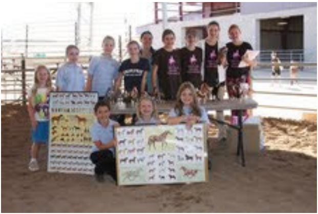
Barn Stormers host Girl Scouts to work on badges

Me the Artist Studio in Phoenix. They had a great time having fun together and painting their favorite equine. It was great to see how each horse was personalized to represent