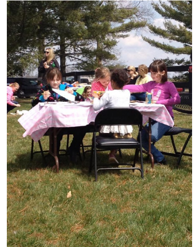
Easter Activities at Diamond View Farm

The youth hunted for eggs, colored, had 3-legged races, feed sack races, dizzy bat race, and had horse rides.