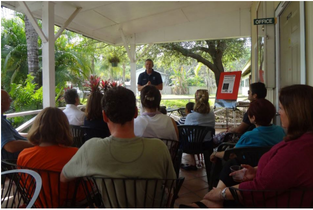
Sassy Steppers host Pressure Proof Your Riding Seminar

to support Naples Equestrian Challenge, the local therapeutic riding program.