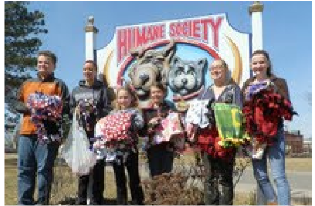
Tall Tails delivering fleece blankets to Humane Society

fleece kennel blankets to donate to the Genesee County Humane Society. The group delivered them on a sunny, Saturday afternoon and received a tour of the facility. There were many cute dogs and cats there...a reminder to us all that when looking for a new pet, don't forget your local shelters,