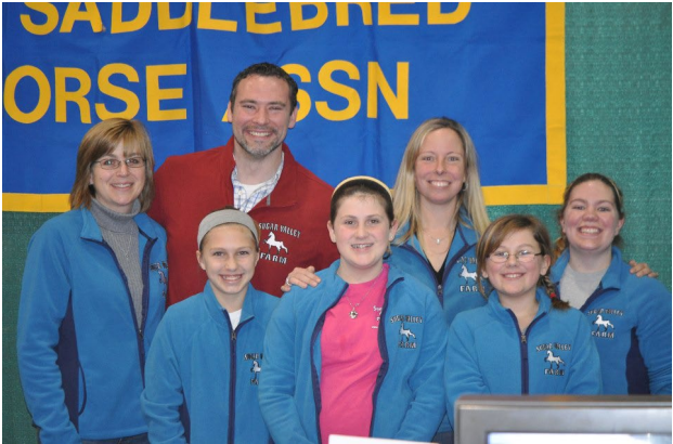
Sugar Valley Farm volunteering at Horse World Expo

Members of the Sugar Valley Saddle Club kicked off the new year with their first ever club meeting in January!