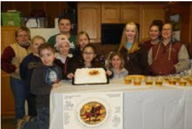
Tall Tails at Wing Commander Celebration

In February, eleven youth and families traveled to Kentucky for the Annual Conference and Awards Banquet. For some it was their first time to go. Our members swept the top national and regional titles in Showmanship, and many Academy Medals were also received. The