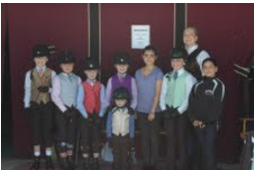
Sassy Steppers ready for Gasparilla

at the online blog: www.sassysteppers.com