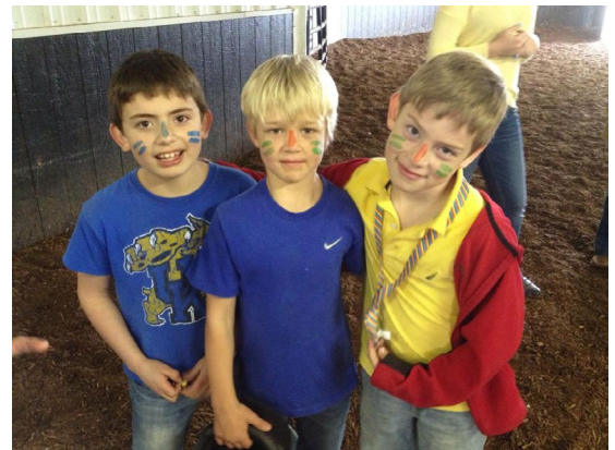
Faces painted at Diamond View Farm's Easter party