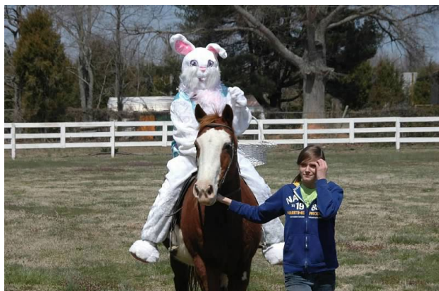
The Easter Bunny arrives at Cash Lovell Stables