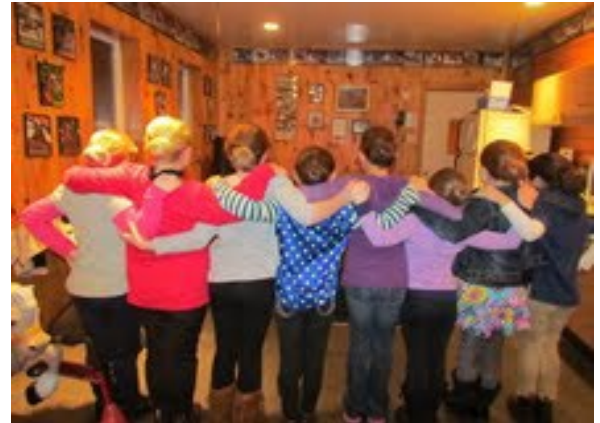
Wentz Weanlings show off their bun making skills

as judges and held a three-gaited, five-gaited and pleasure class; hair braiding and grooming demo; horse movie night; and a horse show attire lesson. We are planning a barn sleepover for all club members and taking a group field trip to the local fun shows in the area. Many more Saddlebred activities to come!