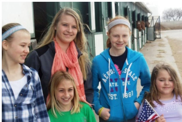
Abby Road Riders visit William Woods University

on to William Woods University in Fulton, Missouri. The University was hosting the World Cup Tryouts for the Three-Gaited and Five-Gaited teams. It was great opportunity for our students to watch terrific riders from the United States, South Africa, and Canada.