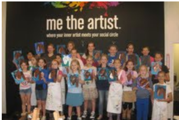
Barn Stormers at Me the Artist

A Riding Camp was held during the week of Spring break, and 4-H ride meets started in early April at the barn...where everyone has the opportunity to join. The first Fun Show is scheduled for April as well. Spring cleanups are planned for May at Executive Farms and at Amazing Wings, a therapeutic riding center in Goodrich.