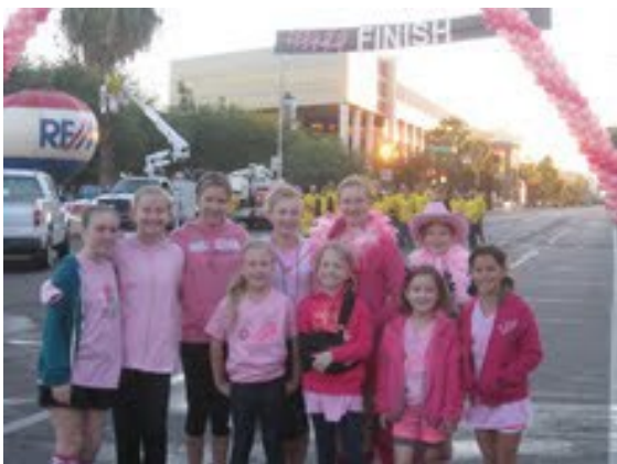
Barn Stormers at the finish line of Race for the Cure

questions about the horses and their care. We can't wait to visit again when the new batch of babies are born in the Spring! Also back in December, the group took a field trip to attend the Cavallia Odysseo