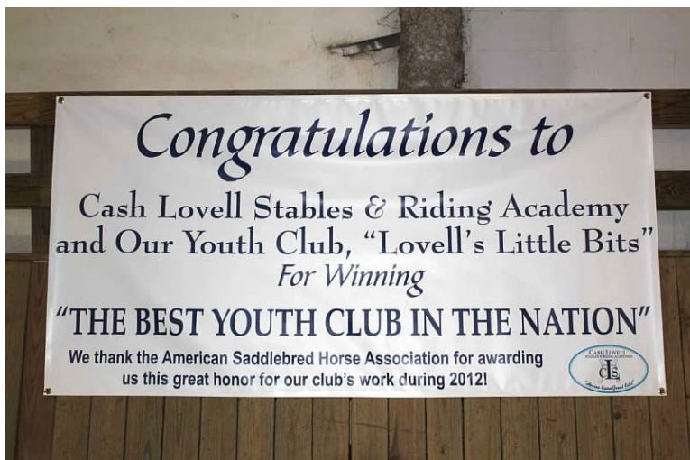
Little Bits made a banner to commemorate their accomplishment of Youth Club of the Year