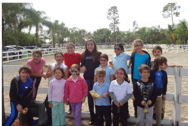
Sassy Steppers Barn Show

It's been a busy inaugural season for Sassy Steppers, the new youth saddle club based at Bobbin Hollow Equestrian Center in Naples, Florida. The club was launched in January 2013 and quickly grew to its current level of over 30 members. Most of