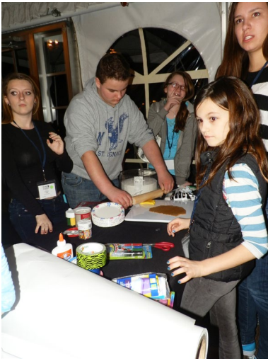
Tall Tails participating in Cake Boss Contest at ASHA Youth Convention

tional event for our club – the Celebration of 70 years of Wing Commander party. We tied into the Michigan Saddlebred Horse Association's event held at the historic Dodge Stables and Meadowbrook Mansion in Rochester, Michigan – the birthplace of Wing Commander. While that event was for adults only, our club decided to have a special birthday/anniversary cake and sparkling punch to honor the importance of Wing Commander in