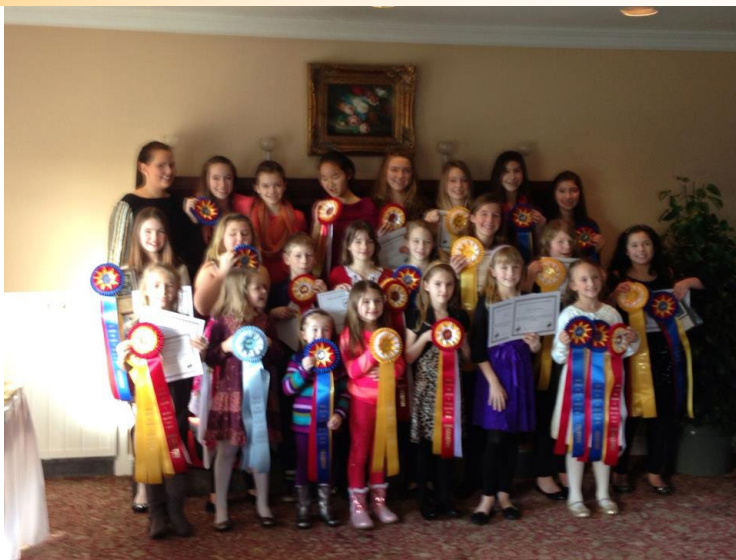
This page - clockwise, Kierson Farm Academy; Walnut Way Farm academy award winners